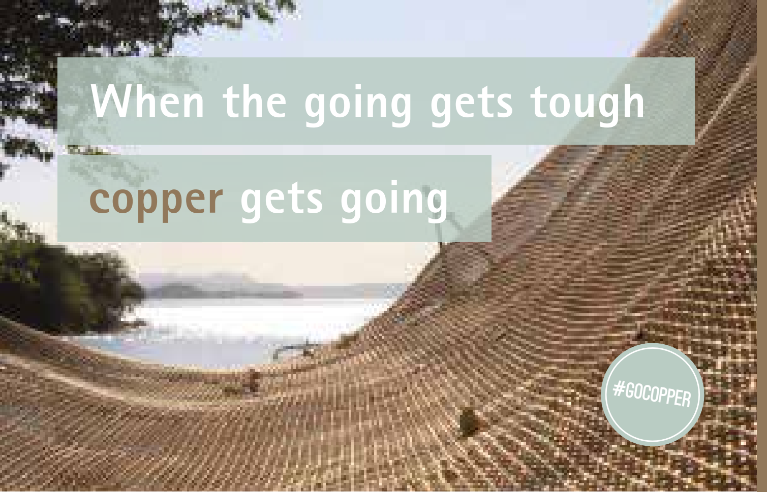
Copper fish cage, Mozambezi Tilapia Farm – Cahora Bassa, Mozambique

gets going to stand up to predator attacks