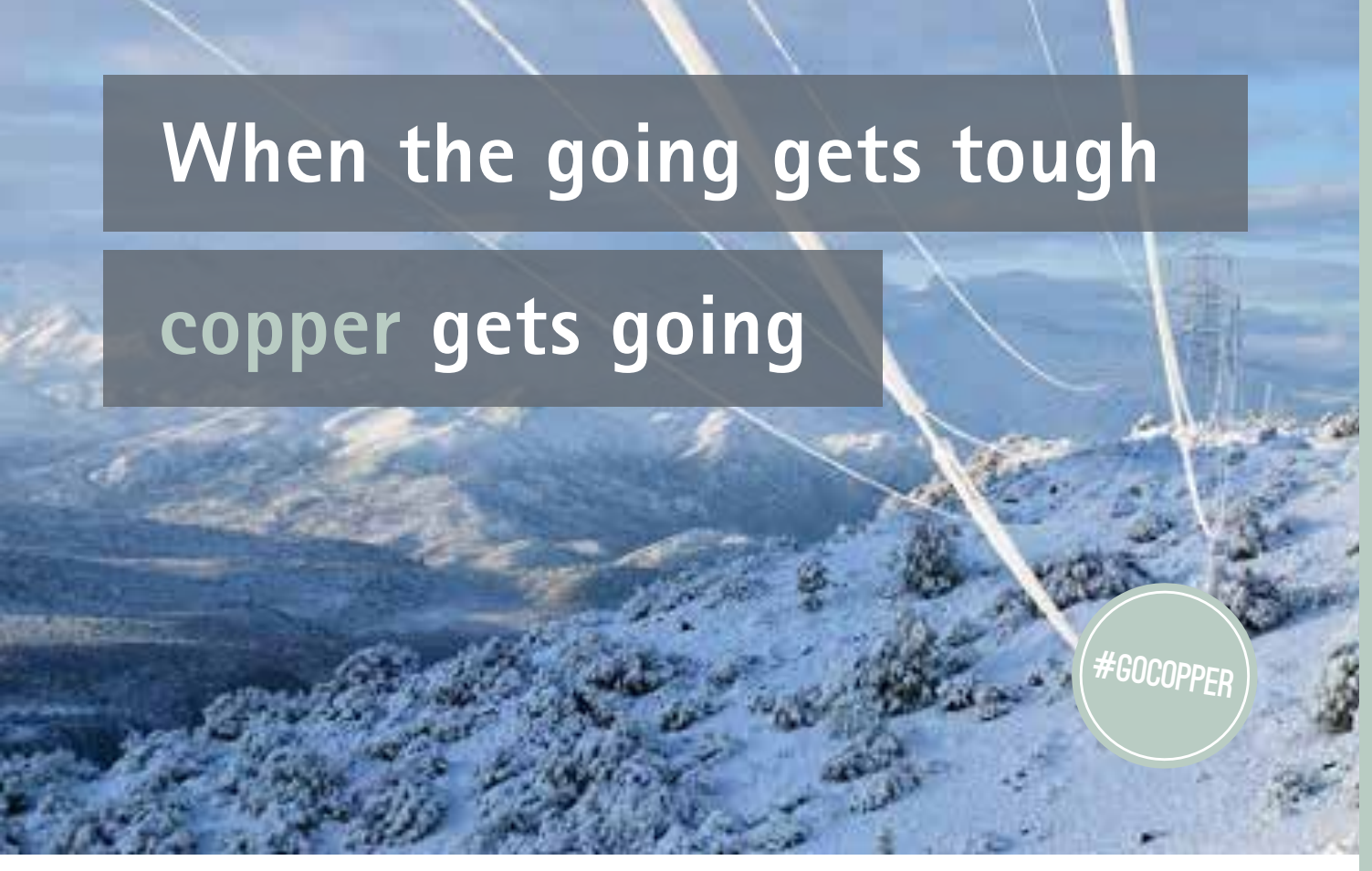
Micro-alloyed copper overhead lines withstand severe ice storms - El Tienente Copper Mine, The Andes, Chile

gets going to take the icy Andes challenge