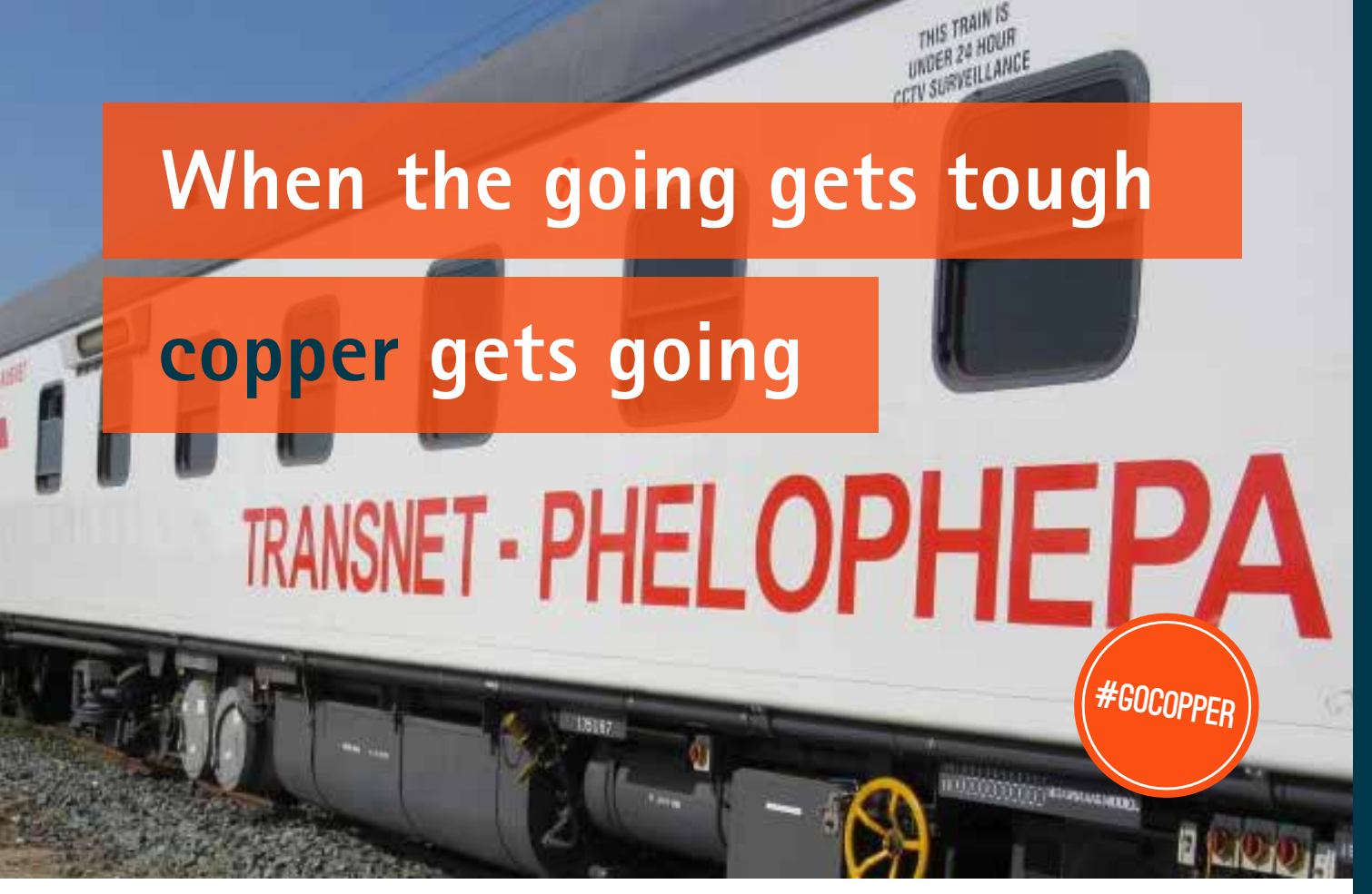
Transnet's Phelophepa I and II mobile healthcare trains equipped with copper – South Africa

gets going to spread healthcare to rural areas