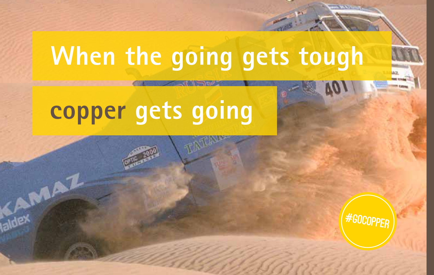
Kamaz truck with CuproBraze® radiator – Sahara desert, The Dakar Rally