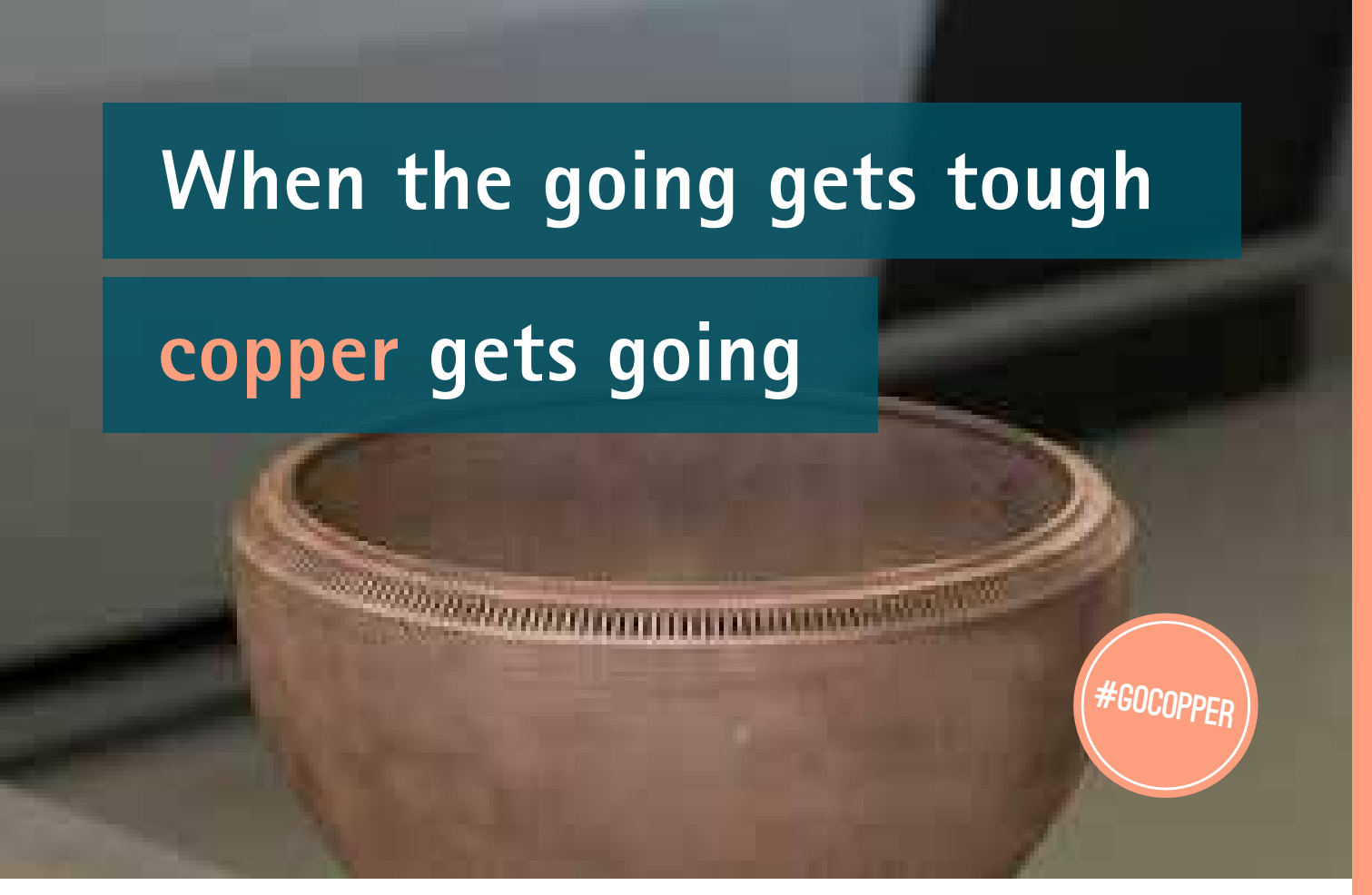
Copper rocket combustion chamber liner made with 3-D printing - NASA, USA